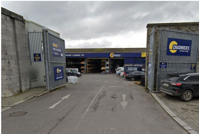
Figure 1: Protected structure and roof in question as viewed from Scarlet Street.

The referrer has sought a Section 57 declaration as per the Planning and Development Act 2000 (as amended) in respect of works to a protected structure at Scarlet Street, Drogheda. The applicant is seeking to remove the existing asbestos roof cladding from the existing portal frame warehouse/storage building on the site and fit a replacement roof covering of proprietary profiled metal insulated roof panels to match as close as possible, the profile and colour of existing adjoining profiled metal insulated roofs on the site.