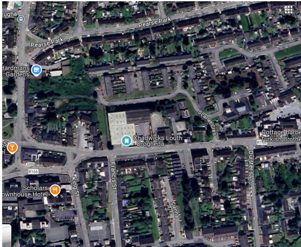
Figure 3: Location demoted by blue marker.