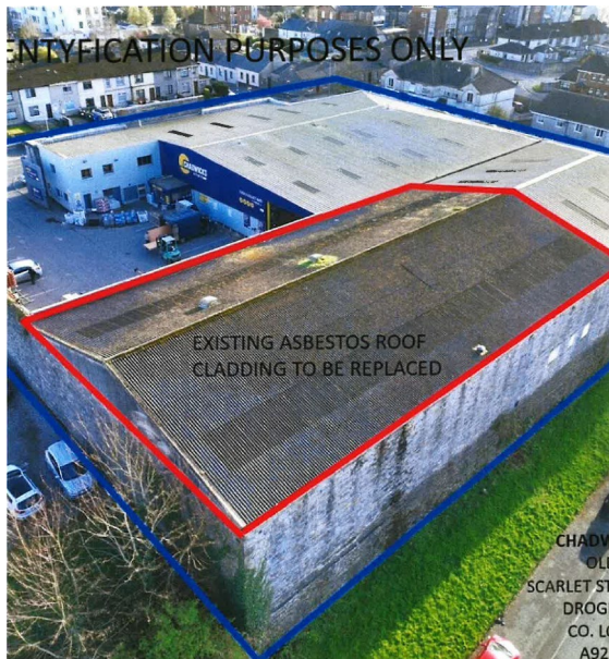
Figure 2- Bird's Eye View imagery submitted by the applicant detailing the existing roof