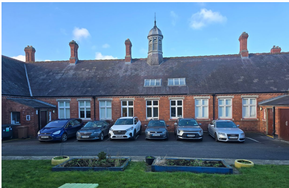
Image of roof where 14 solar panels to be erected.