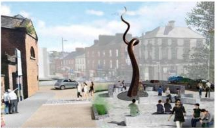
Infinity Spiral – Concept Picture 2