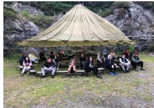
Youths enjoying a day out at Carlingford, Co. Louth PEACE IV funded project Engagement and Signposting Service