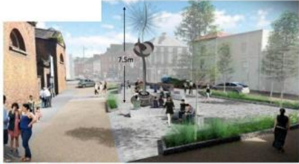
Artwork – Concept Picture 1