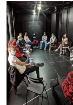
Participants at workshop in The Garage Theatre, Monaghan.