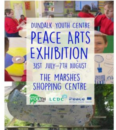
Invitation to PEACE IV – Peace Arts Exhibition