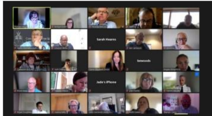
Participants taking part in the closing event of the PEACE IV funded project “Leading the Way” on 9 th May 2022 over Zoom.