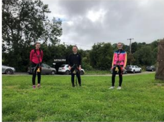
Social day out in Forkhill, Co Armagh as part of the PEACE IV funded project Engagement and Signposting Services.