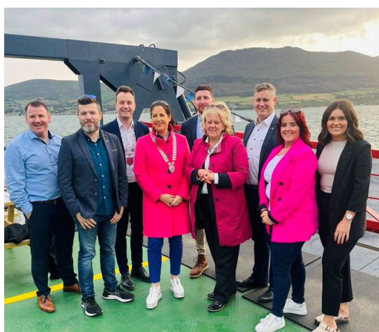
Dundalk Chamber of Commerce Carlingford Lough Cross-Border Business Cruise

Louth County Council was the principal sponsor of the Cross-Border Summer Business Cruise which was hosted by Dundalk Chamber together with Newry, Drogheda and Kilkeel Chambers and South Armagh Business Improvement Group in June 2023. It is anticipated that this event will take place again in 2024.