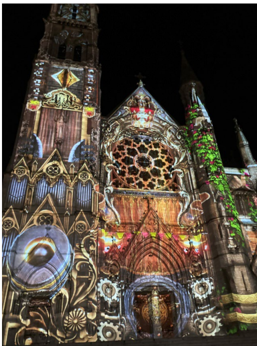
St. Peter's Church – Lú Festival of Light

Following the huge success of the Lú Festival in 2022 and 2023, Louth County Council will again host this event in 2024.