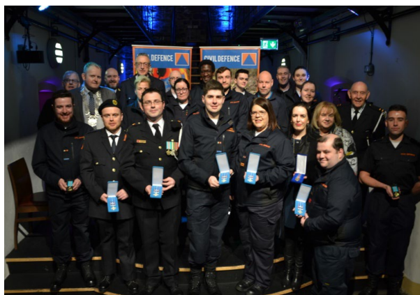
Civil Defence Long Service Awards Ceremony

To date this year, Civil Defence volunteers have responded to 101 separate requests for assistance. This includes a large number of local community duties as well as a number of larger events including the visit of President Joe Biden, the Irish Legends Golf Tournament and the Harry Styles concert in Slane.