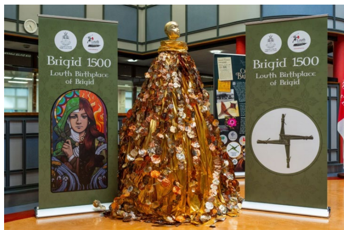
Brigid 1500: Louth Birthplace of Brigid programme of events launched

The enduring story of Ireland's iconic matron saint was celebrated at the launch of Brigid1500: 'Louth Birthplace of Brigid'. A programme of events and initiatives to honour the life and legacy of Brigid will commence in January 2024.