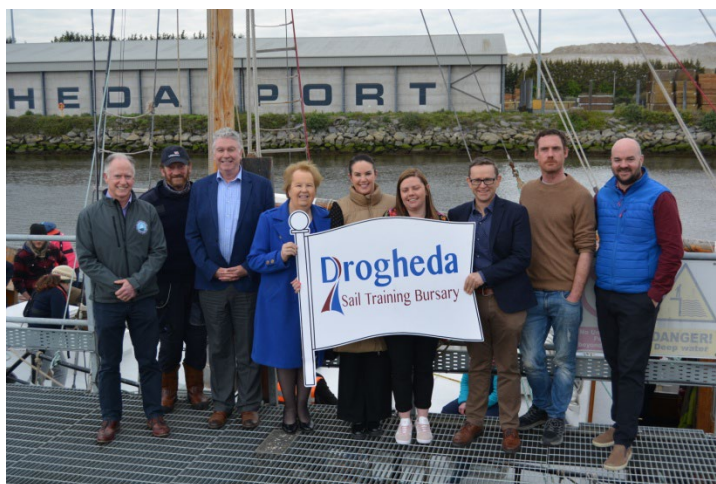
Launch of the Drogheda Sail Training bursary

Louth County Council are the main sponsor for the Drogheda Sail Training Bursary which has supported over 150 young people in Louth and Meath. The Scheme caters for young adults between the ages of 14 to 30 years, and it is anticipated will run again in 2024.