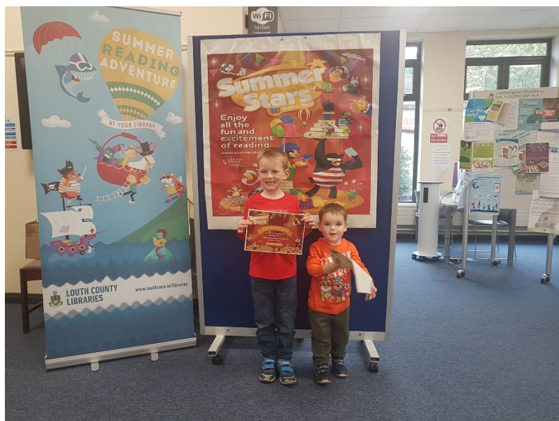
Left: Children receiving their Summer Stars reading certificates in Ardee library