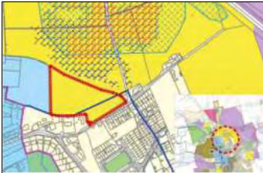
Figure 2: Extract from Section 2: Chief Executive’s Summary, Response and Recommendation on Zoning Submissions (p.330) identifying lands associated with Submission LCDP DR07

According to the table contained at page 6 of the Material Alterations to Maps section, alteration no. ARD1 relates to Submission number 071. Submission LCDP DR071 relates to a completely different site to the north of Ardee as identified below by figure 2. The Report of the Chief Executive on submission LCDP DR071 received on the draft plan states “on foot of the submission from the OPR and EMRA, the lands are now identified as Phase 2 lands” recommending a mapping change to identify submission LCDP DR07 lands as Phase 2 (p.330). It is apparent that the order of priority change should have applied to the lands affected by submission 071 which are the lands edged red in Figure 2 below and not to Mr. Callaghan’s lands.