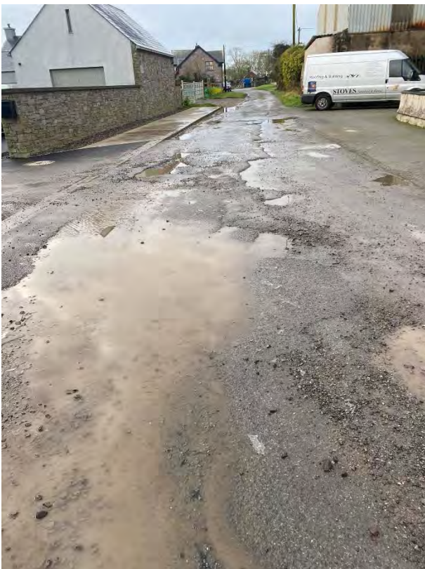
Figure 1.1: Existing surface of The Burren village road