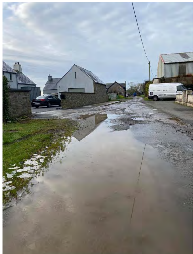
Figure 1.2: Large body of water in one area