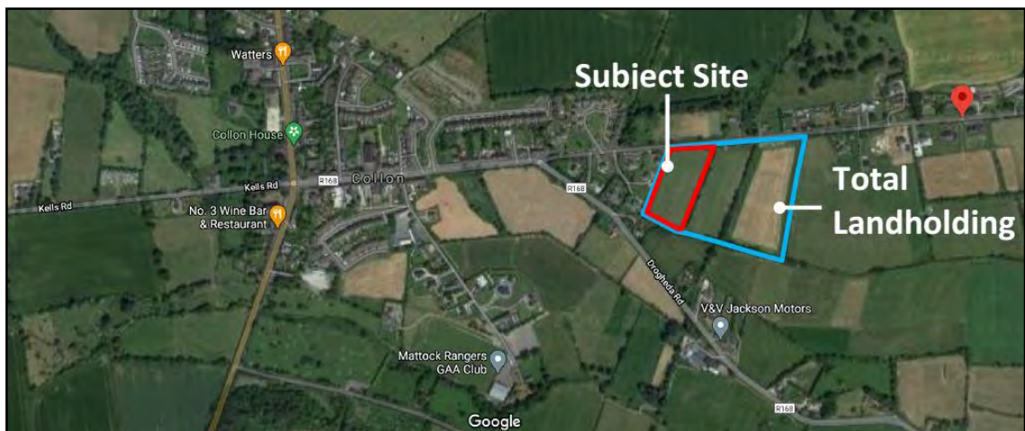
Map 1: Site Location Map