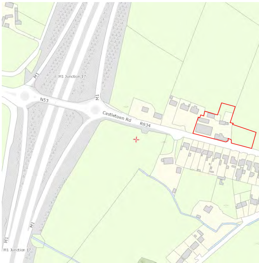
Figure 1 Location Map – Ordnance Survey Ireland

The subject site has a total site area of 0.466Hectares and is located along the Castleblayney Road the old N53. It is located approximately 3.5km outside Dundalk and within close proximity to Junction 17 of the M1 motorway. The N53 roadway is an important access route to both the M1 (i.e. Dublin or Belfast) but also to Castleblayney and Monaghan.