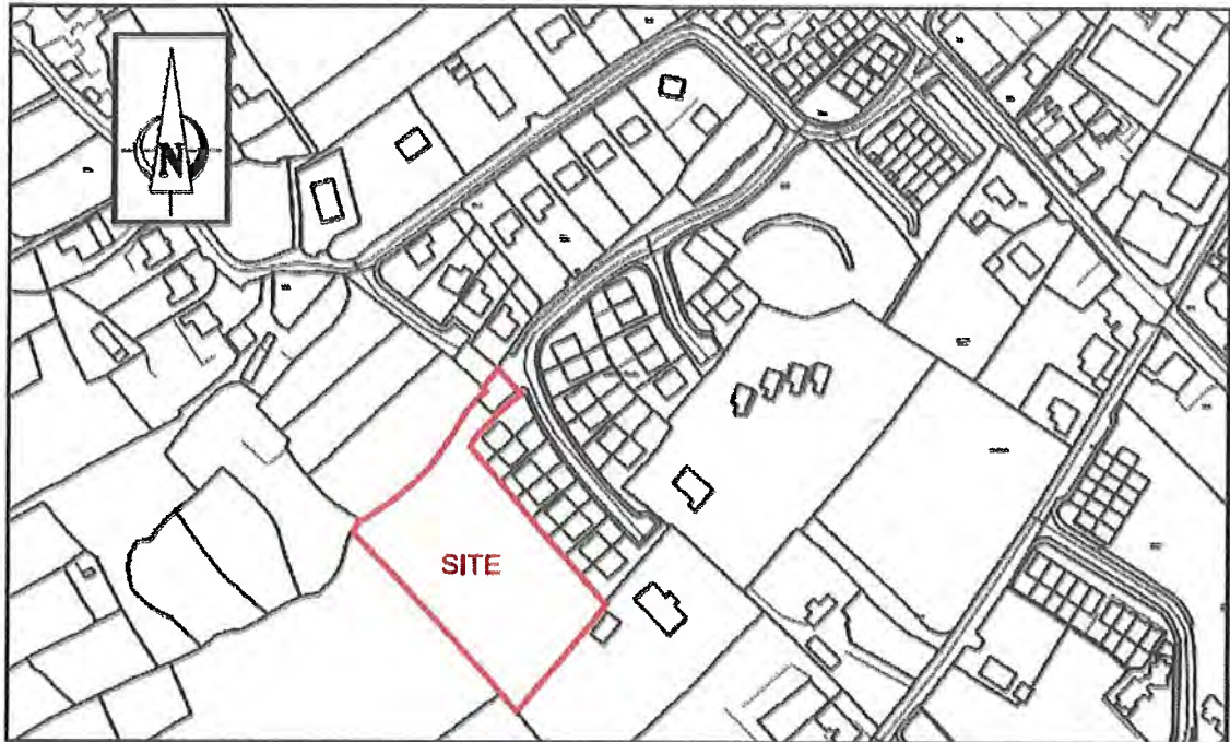
Figure 2: Site Location Map