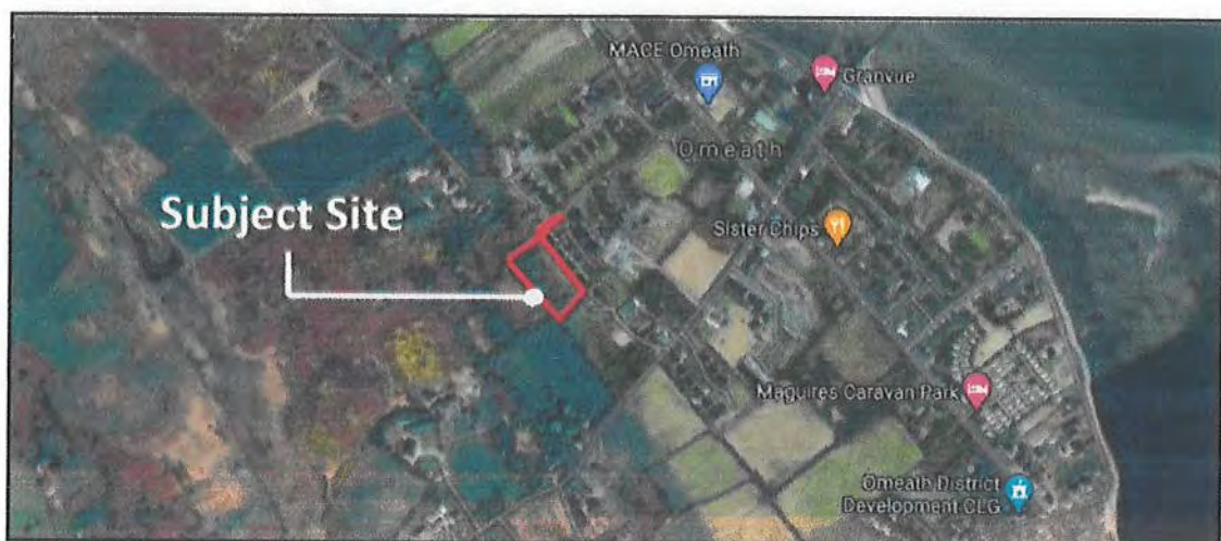
Figure 1: Site Location Map