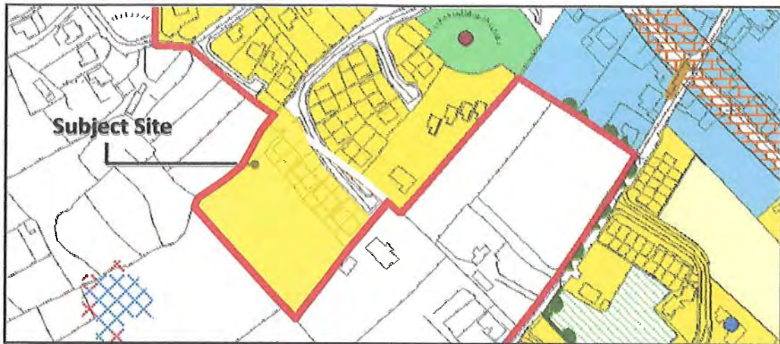
Figure 3: Alternative Settlement Boundary & Zoning Map