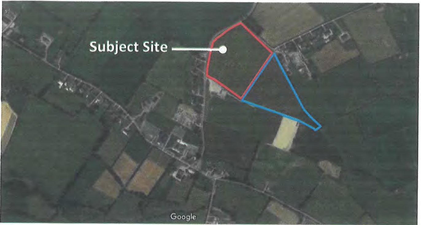
Map 1 - Site Location Map