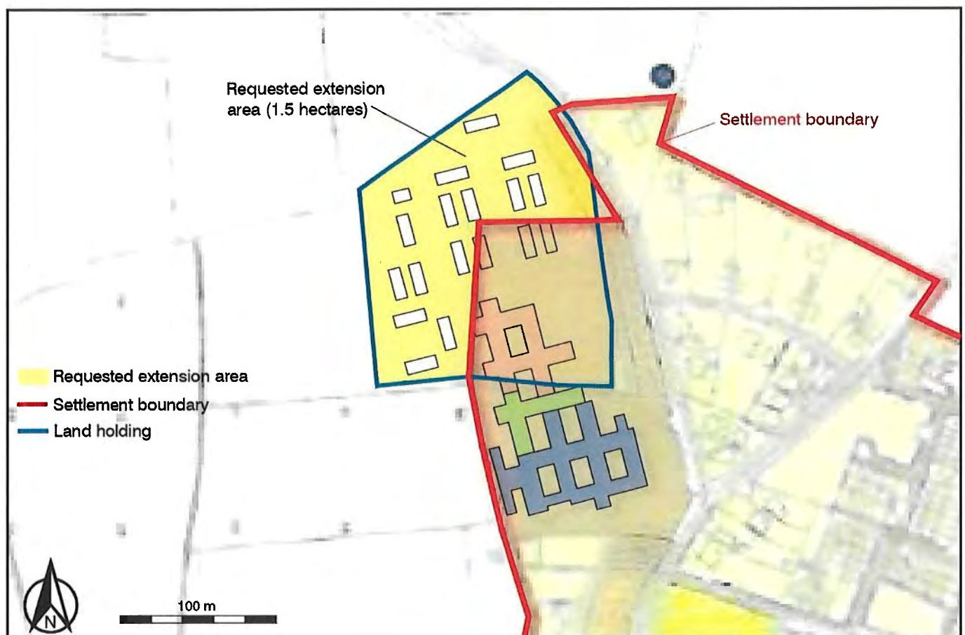
Illustration 3: Plan showing Requested Alteration to Settlement Boundary.

We would ask that the additional lands within such an extended boundary be zoned either A2 or G1 to allow for new supported independent living for the elderly.