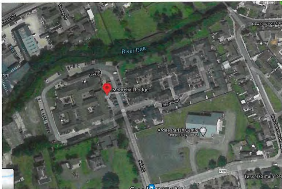
Plate 1. Aerial Photograph of Moorehall Nursing Home and Retirement Village, Ardee

The retirement village at Moorehall Lodge is reflective of the type of facility that it is envisaged for the site at Sunhill Nursing Home, where elderly people can live independently with support services provided from the Nursing Home.