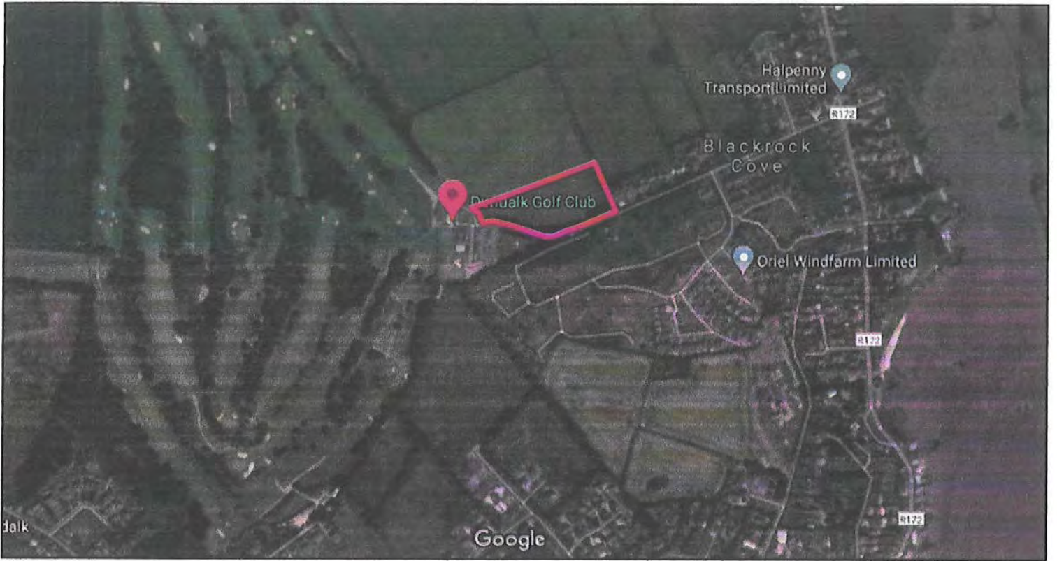
Map 1 - Site Location Map