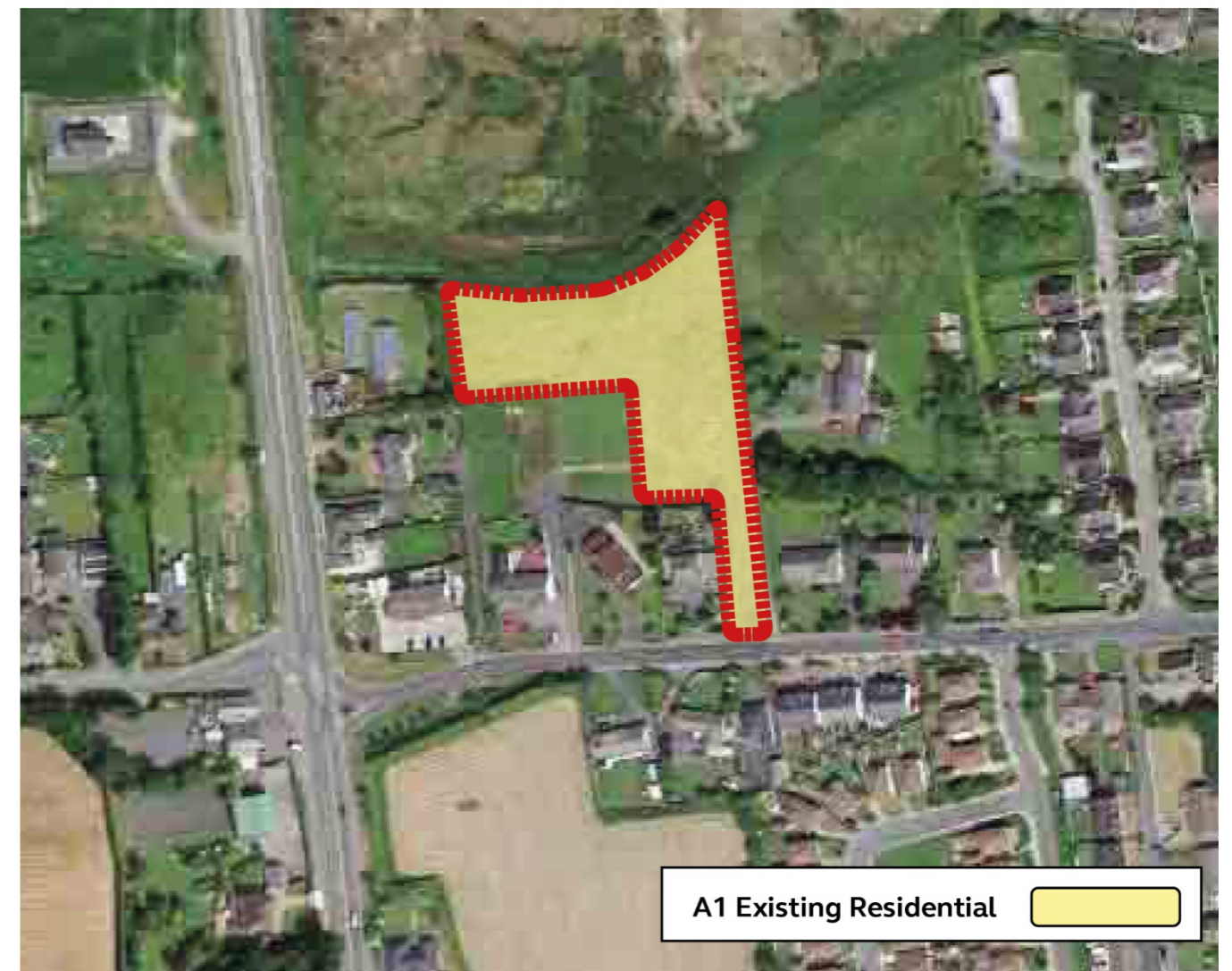
Recommended Zoning under Louth County Development Plan 2021-2027