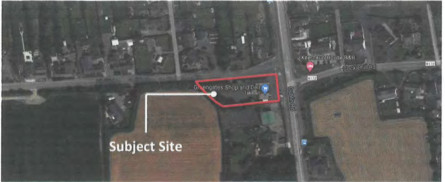
Map 1 - Site Location Map