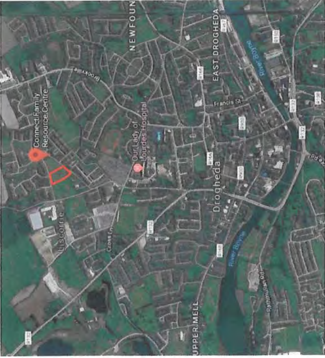
Moneymore Community Centre: Site Location Plan