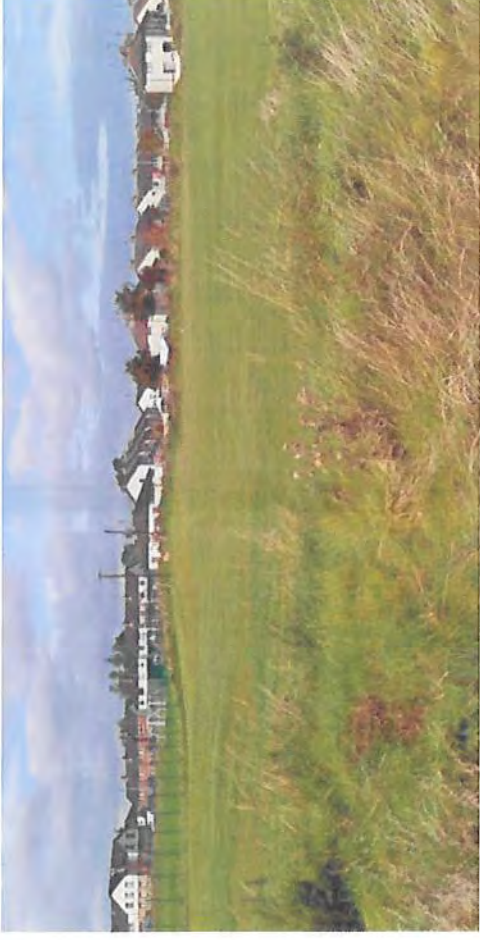
Moneymore Community Centre: Site View towards St.Laurence's Drive