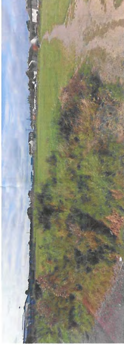
Moneymore Community Centre: Site View towards St.Laurence's Drive with Existing Path