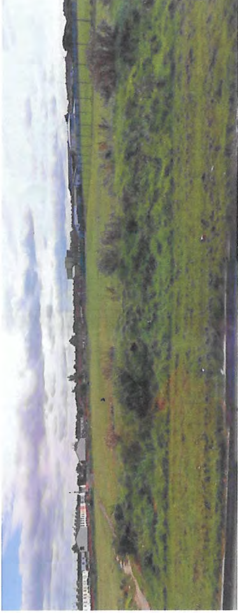
Moneymore Community Centre: Site View from St. Laurence's Drive