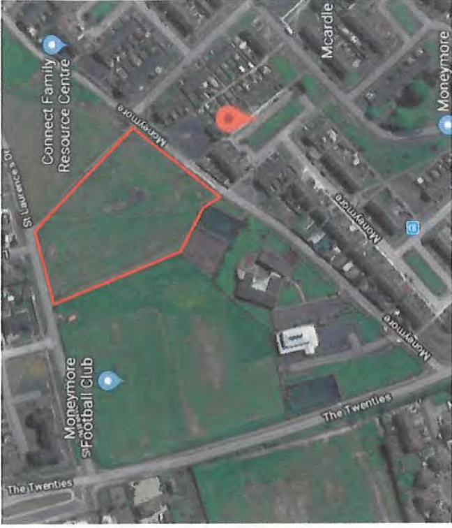
Moneymore Community Centre: Site Plan