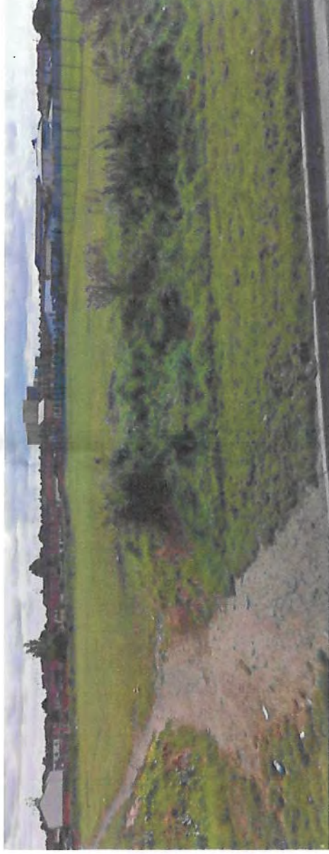
Moneymore Community Centre: Site View from St. Laurence's Drive with Existing Path