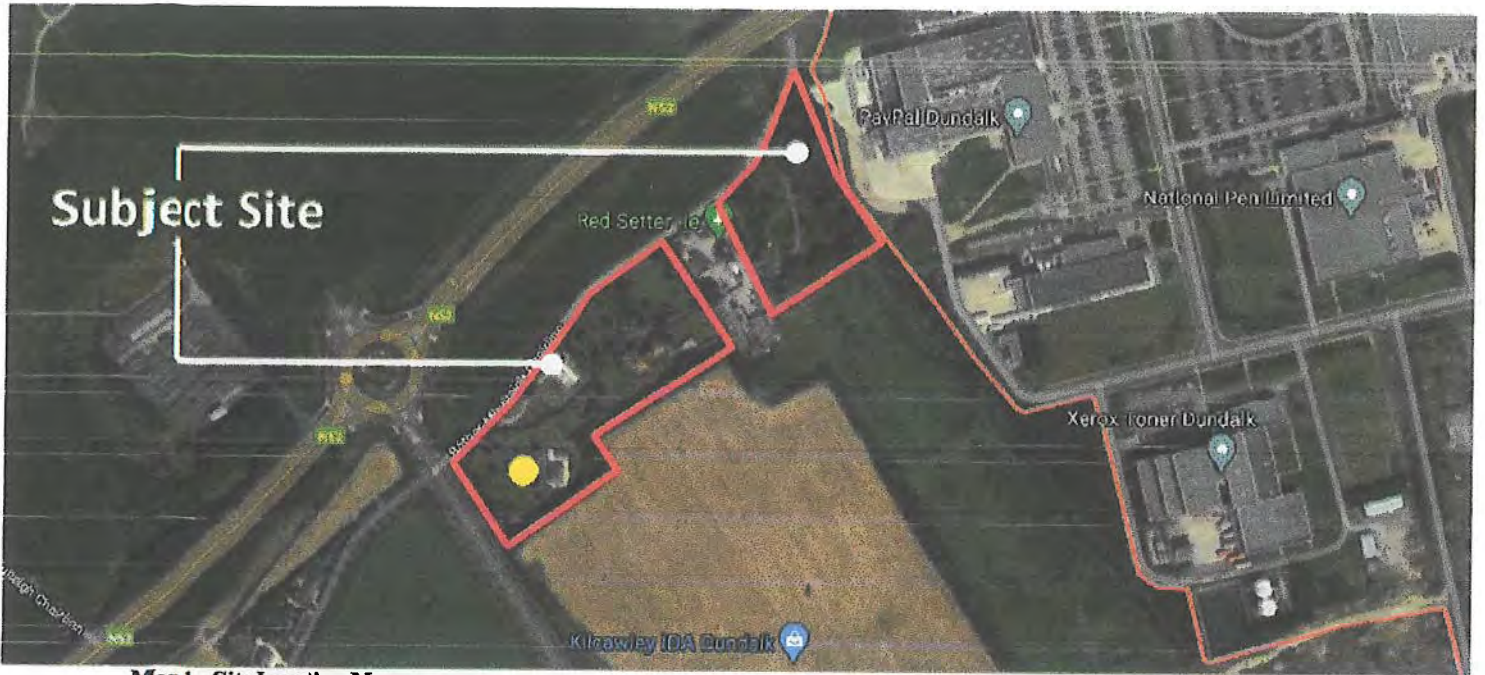
Map 1 - Site Location Map