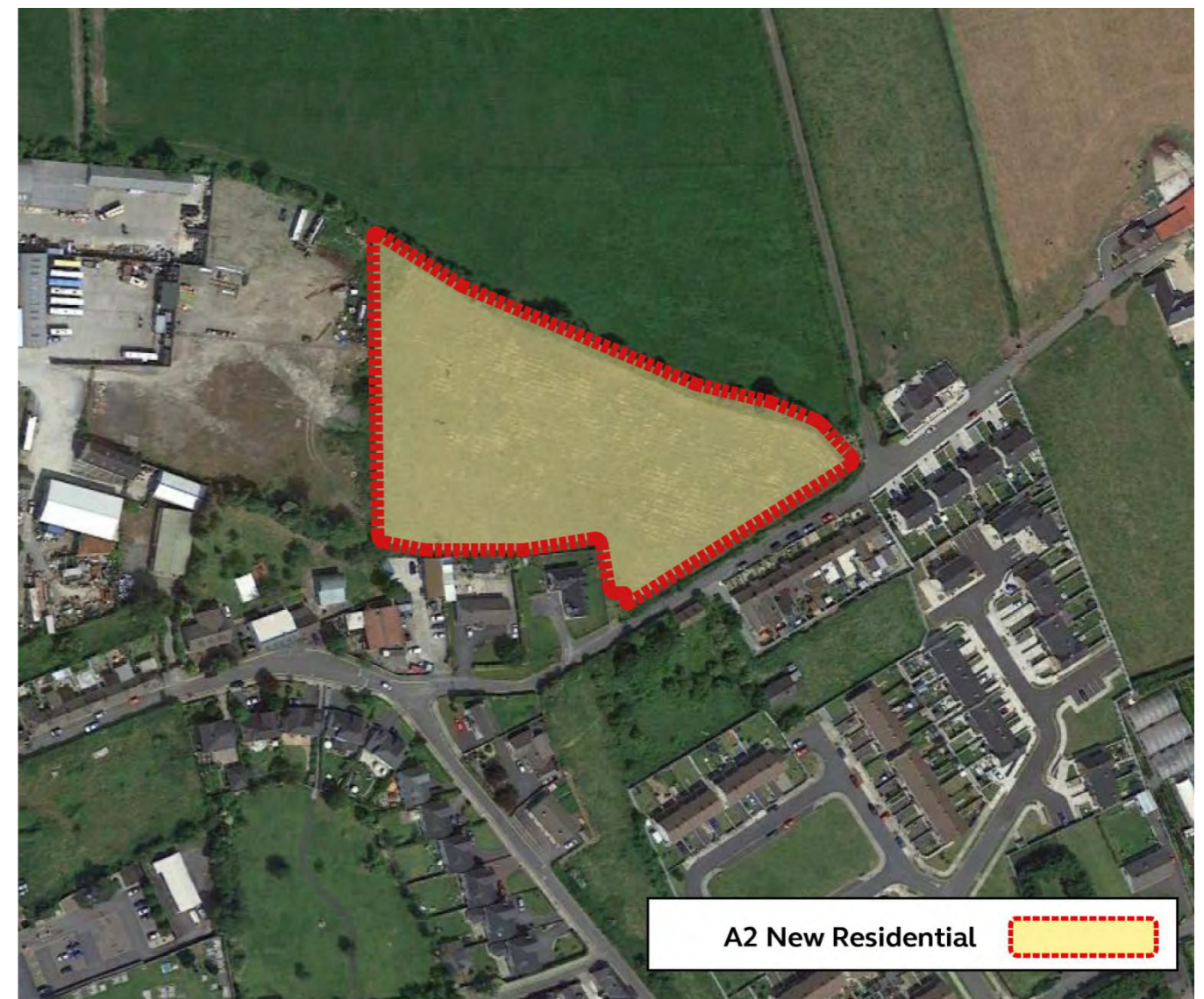
Recommended Zoning under Louth County Development Plan 2021-2027