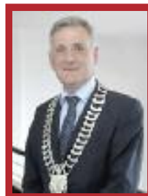
Jim Darcy Cathaoirleach Louth County Council