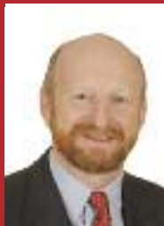
Fine Gael Anthony Donohoe