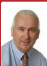
Fianna Fáil Declan Breathnach