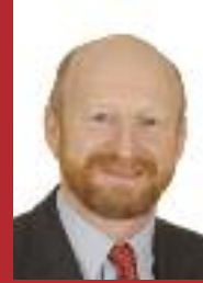
Fine Gael Anthony Donohoe