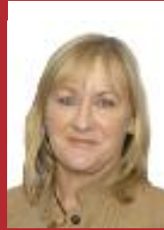
Sinn Féin Imelda Munster