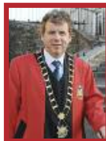
Michael O'Dowd Mayor Drogheda Borough Council