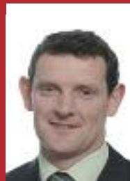
Fine Gael Colm Markey