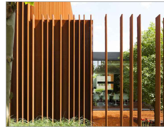
Vertical metal fins