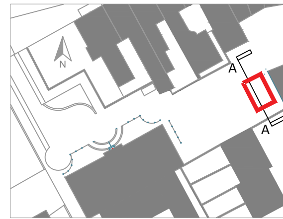
Keyplan - Learning Pod