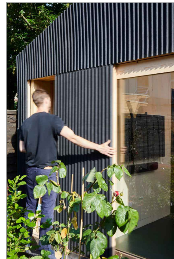
Vertical cladding and sliding door