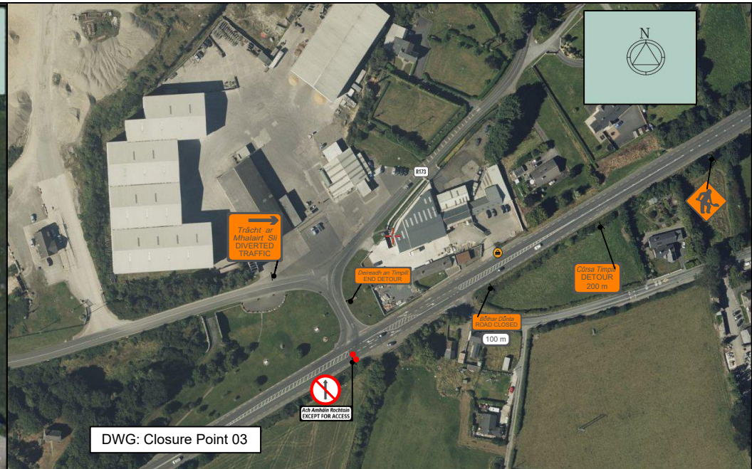
DWG: Closure Point 03