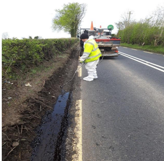
Louth County Council crew filling/repairing ruts along the side of N53 Dundalk to Castleblayney Road.

Street cleaning and emptying of litterbins is ongoing, with bins emptied in Blackrock every Friday & Monday. Illegally dumped waste was collected from various locations including Carnmore and Balregan and litter picking was carried out on the N53 and LP3125 at Hackballscross.