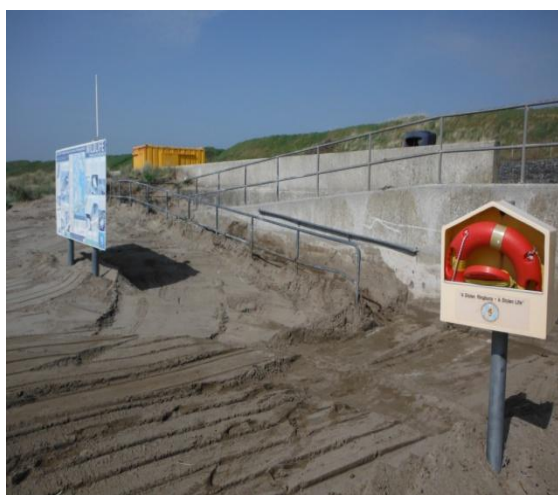
Clearing sand from pedestrian walk way at Templetown Beach in preparation for summer of 2019

Increased amounts of illegally dumped rubbish and tyres have been lifted at various locations. Asbestos containing materials have also been dumped at a number of locations and require the services of a specialist licensed contractor to dispose of same.