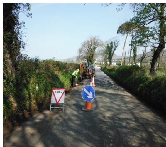
Castletowncooley being prepared for surface-dressing R.W.P 2019

Footpath repairs have been carried out in Carlingford.